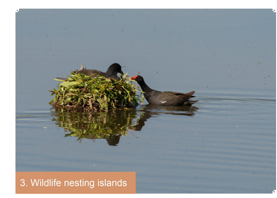
An additional island in the centre of the lake to offer visible refuge from disturbance to nesting birds