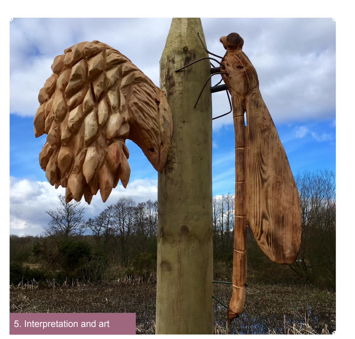
Artistic sculptures and panels interpreting the wildlife and heritage of the park