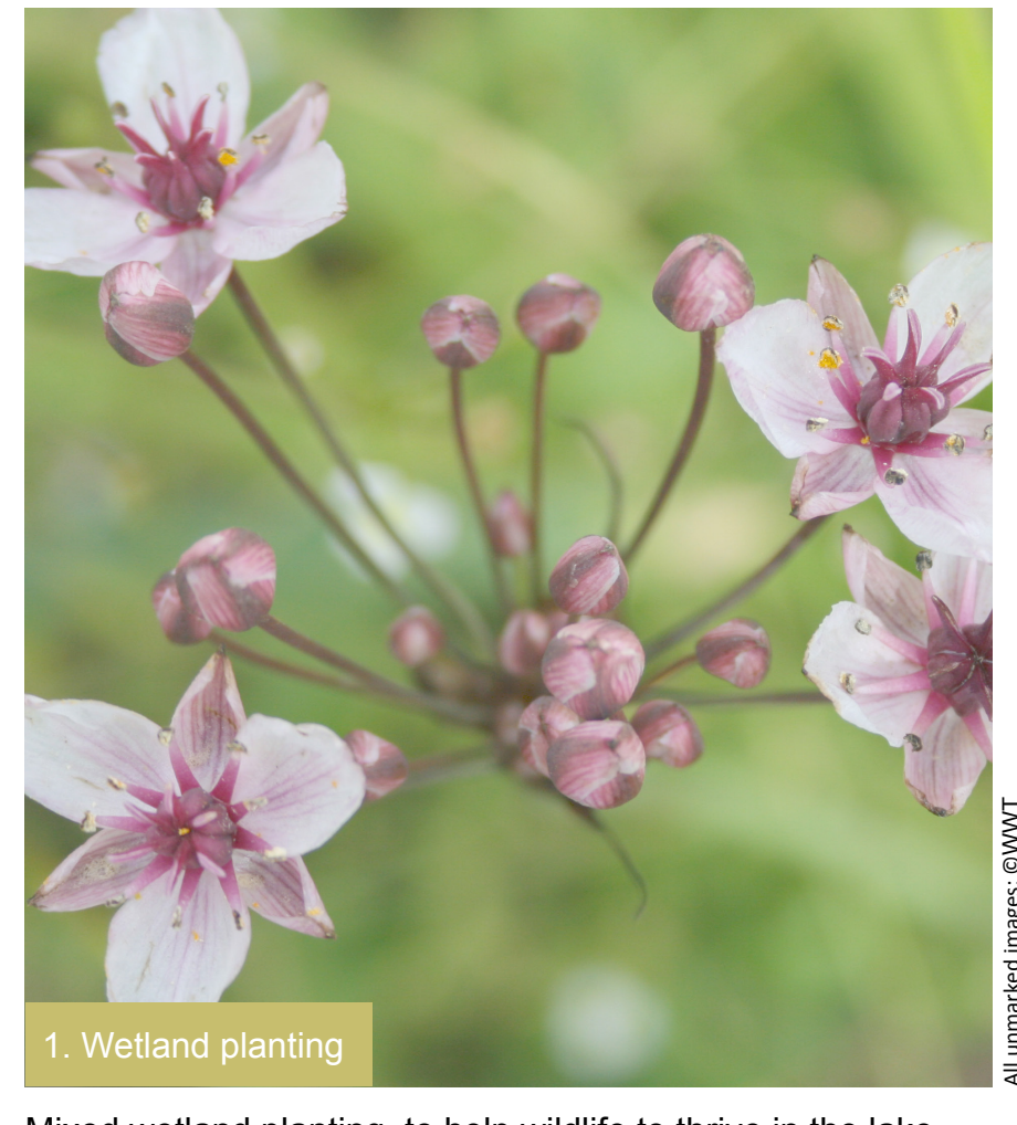
Mixed wetland planting, to help wildlife to thrive in the lake and create a good environment for pond dipping