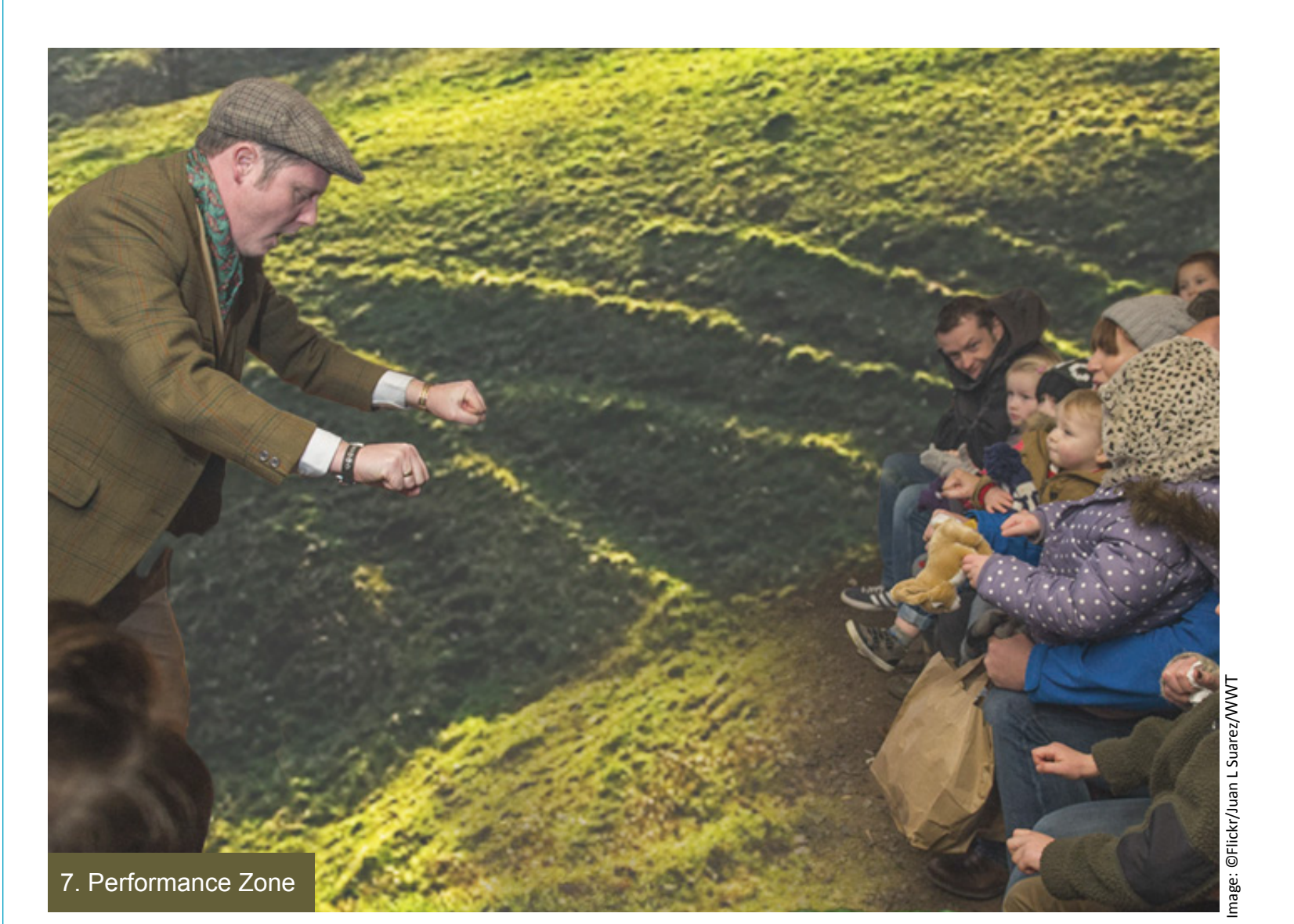
Amphitheatre tiered terraces laid into the grass slope overlooking the lake for performance events