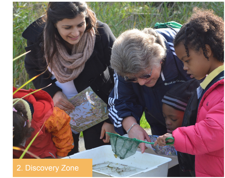
A platform for pond dipping, allowing people to discover the mini-beasts that live beneath the surface of the water