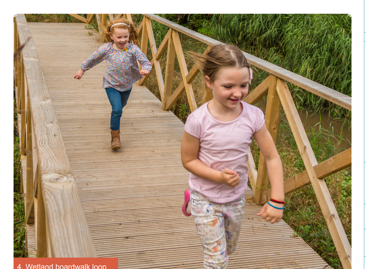
A boardwalk with sights into the existing island, offering people an accessible loopwalk around and across the lake